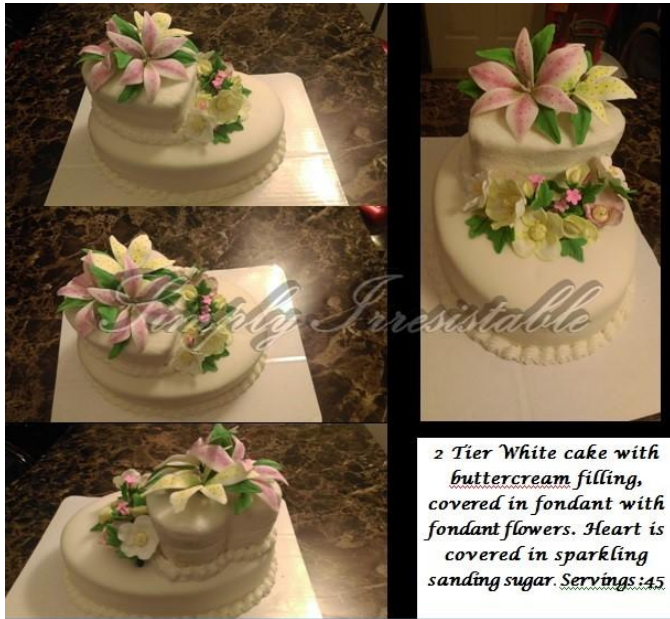
2 Tier White cake with buttercream filling, covered in fondant with fondant flowers. Heart is covered in sparkling sanding sugar. Servings: 45

Traditional wedding servings are 1x2 slices, if you want to serve bigger slices go for more servings than you need. Prices start at $3.00 per serving. Fondant is an extra $20 per tier. Flowers, ribbon and bling are extra. Toppers can be ordered for extra, I do not make wedding toppers. Generally, the bride and groom will save the top tier for their one year anniversary. If you plan to do this, look at the column that says w/o topper for your serving size. You still pay full price as you are still getting all cake but not serving top to your guests, but you want to make sure you have enough servings for your guests.